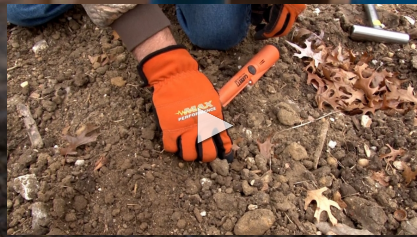
Find More Coins! Garrett ACE Detecting Tips