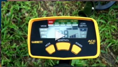
ACE 200 Instructional Video